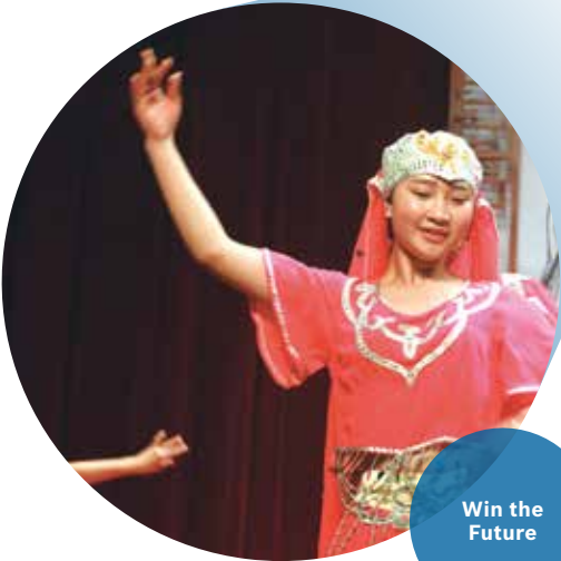
Win the Future

You might ask “Why is BCCC paying so much attention to the diversified educational needs of different groups?” The answer is very simple, because they firmly believe that each child has the opportunity and right to receive equal education. BCCC hopes more and more vulnerable students get qualified education opportunities by promoting diversified education and filling up the blank of education area in China.