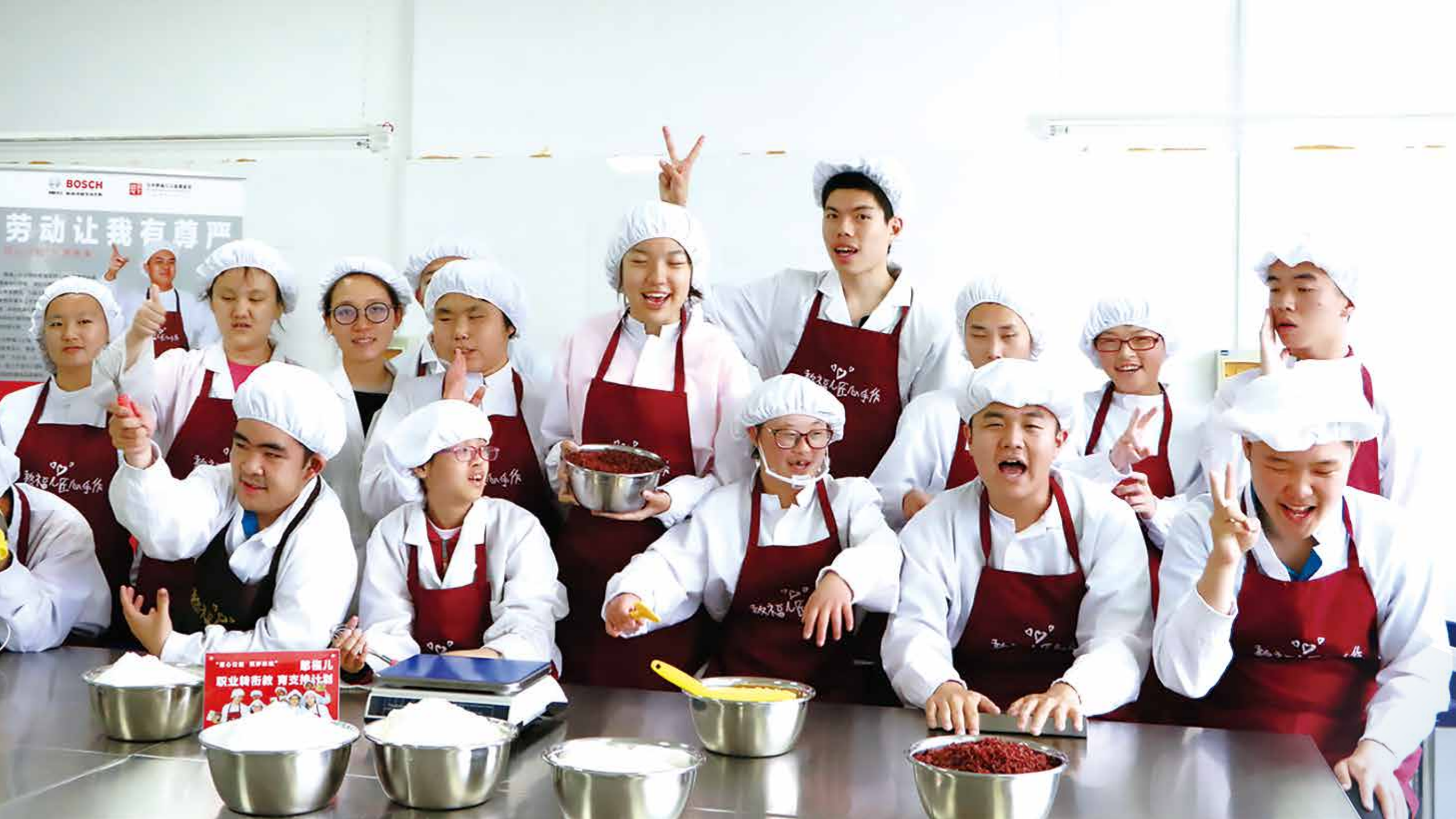
Hanfuer's Vocational Transition Education Support Program