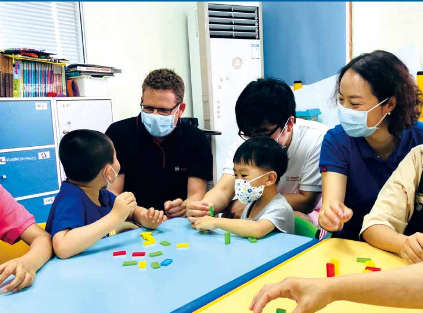
Volunteers Playing Game with the Children

Attention paid to such details were worthwhile. They are happening every day in the New Sunshine Hospital School. Over the past four years, BCCC has found a way to heal the grief of seriously ill children and their families in those subtle details, immersing them in love and care.