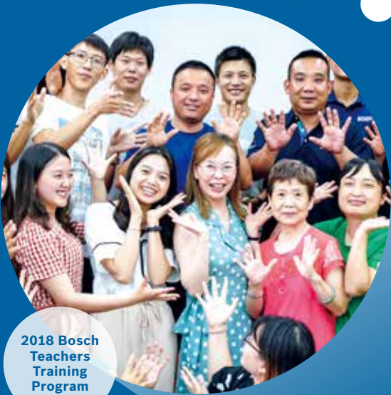
2018 Bosch Teachers Training Program

As one of the many amazing outputs of the program, Recommendations for Building the Rural Small Schools was formed, aiming at scaling up the impact beyond the project sites and bringing benefits to more students and teachers in rural China.